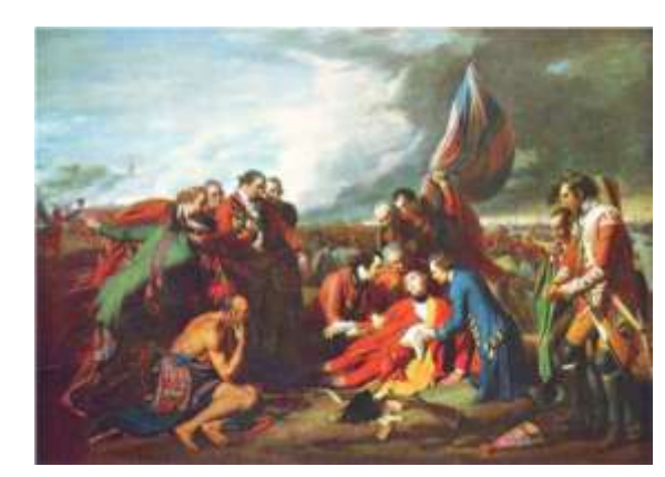
(Artist: Benjamin West Date: 1770)

I shall teach you to exploit the spiritual potential to free yourself.