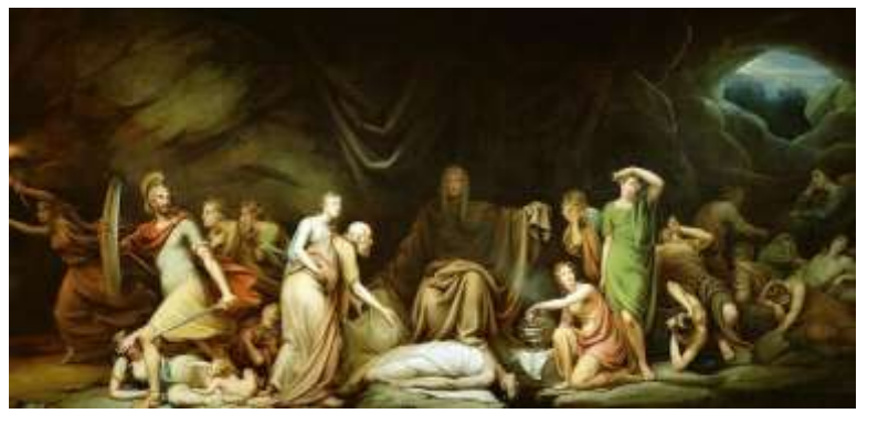
(Artist: Rembrandt Peale Date: 1820)

I shall teach you to behold the seat of omniscience.