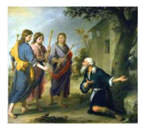
(Artist: Bartolome Esteban Murillo Date: 1667)

I shall prevent you from succumbing to the impulses of likes and dislikes.